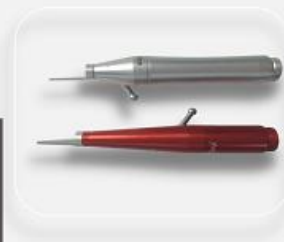
Cutting treatment head

*vaginal treatment includes 360 degree and 90 degree treatment