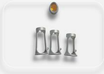
Fractional treatment heads

*3 different spot sizes available (0.1mm, 0.2mm, 1.0mm)