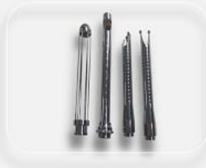
Vaginal treatment head

*non-ablative(1540nm) and ablative fractional head